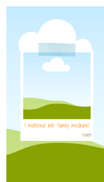
Instagram Story Template 1