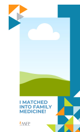
Instagram Story Template 2